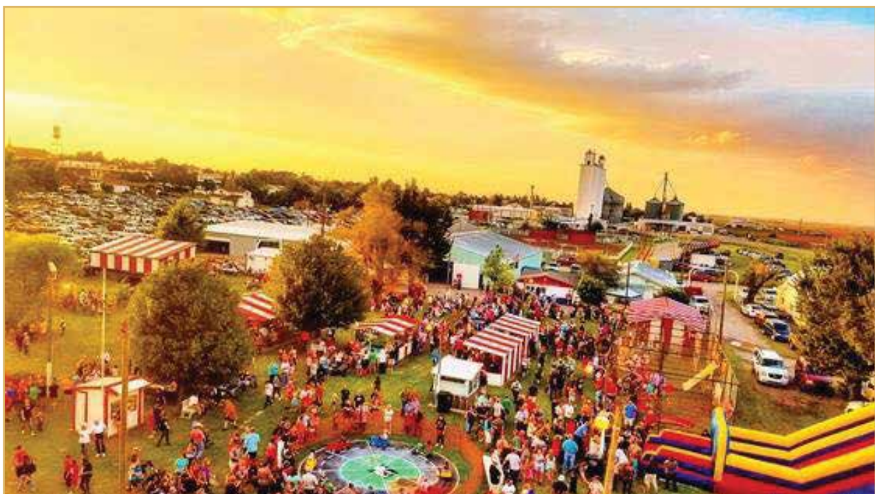
Hinton Fair aerial view 2018

Another timeless fair is being held in Oklahoma. From August 26th – 28th, the Hinton Free Fair will be held at the fairgrounds each evening at 7pm. The fair is also one of Oklahoma’s oldest and most popular community fairs. Locally owned and operated, the fair is believed to have begun in 1905 as an event to showcase the locals and their farm produce & animals. As the fair grew, a permanent location was established for future fairs, and it was moved to its new fairgrounds in the 1950’s. New facilities and rides like the train, Ferris Wheel, swings, the dunking board, and “The Worm” were built over the next few years. With each fair being bigger than the last, new games, rides, and prizes were added. Today, the Hinton Fair boasts an impressive list of challenging and engaging games, thrilling rides, delicious food, and great entertainment.