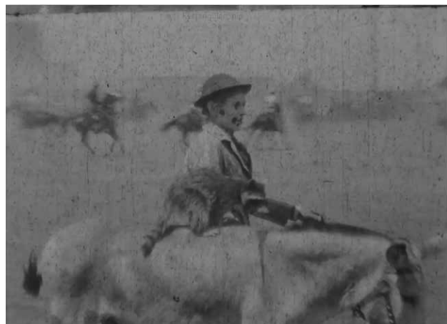
Rodeo Events 1930s, Hinton and Mangum, OK.