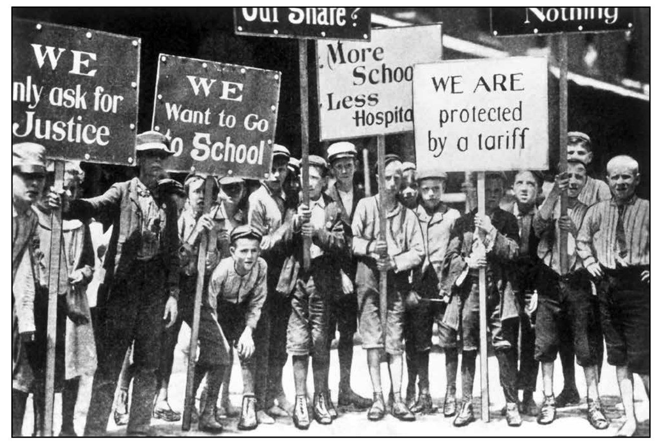
Child Labor strike in Philadelphia 1902

Employers pushed back causing many of these protests to turn violent. In Chicago 1886, several policemen and workers were killed during the Haymarket Riot that broke out when a bomb was thrown at the police. Similar events were cropping up all over the country, and their violent tendencies did more harm than good. Proponents of labor reform found themselves having a hard time, backing workers and unions that many considered to be the cause of such violence. But some companies were listening. Some of the most influential protest tactics were the