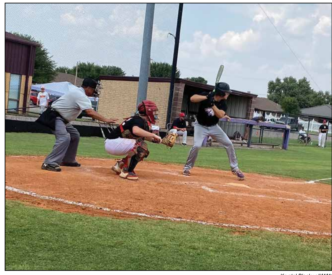
Will update score.... Hydro Eakly faces Navajo