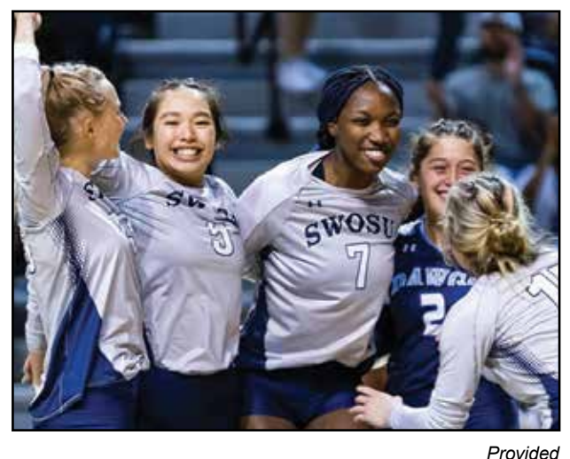
SWOSU Volleyball Celebrates after securing a win against Oklahoma Christian.