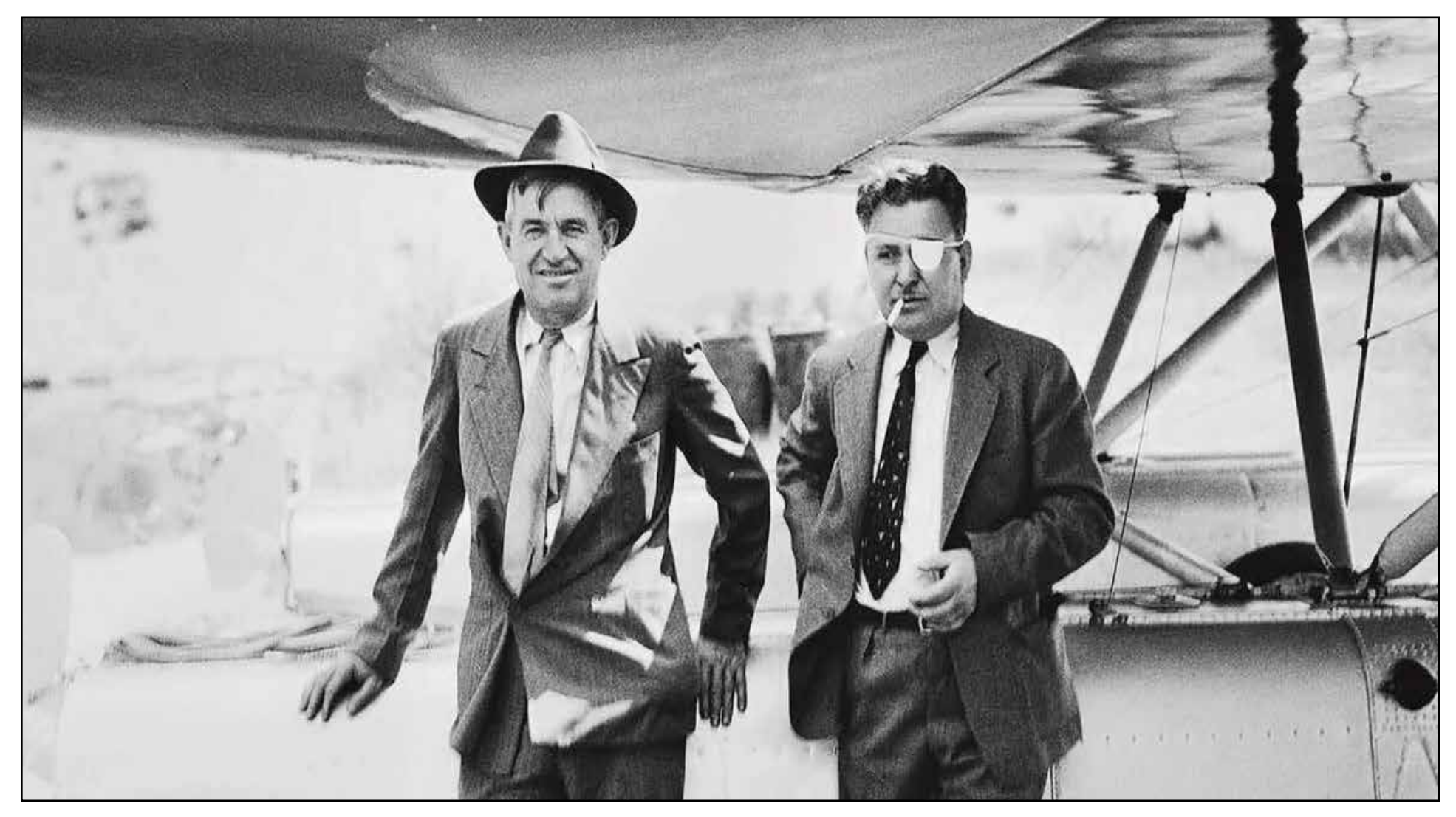
Will Rogers and Wiley Post pose for a photo before taking flight. Rogers and Post were both prolific experimental aviators and this legacy still remains as two Oklahoma City airports bear their names. Both men's lives were cut short in a tragic plane crash in Northern Alaska flying an experimental aircraft.