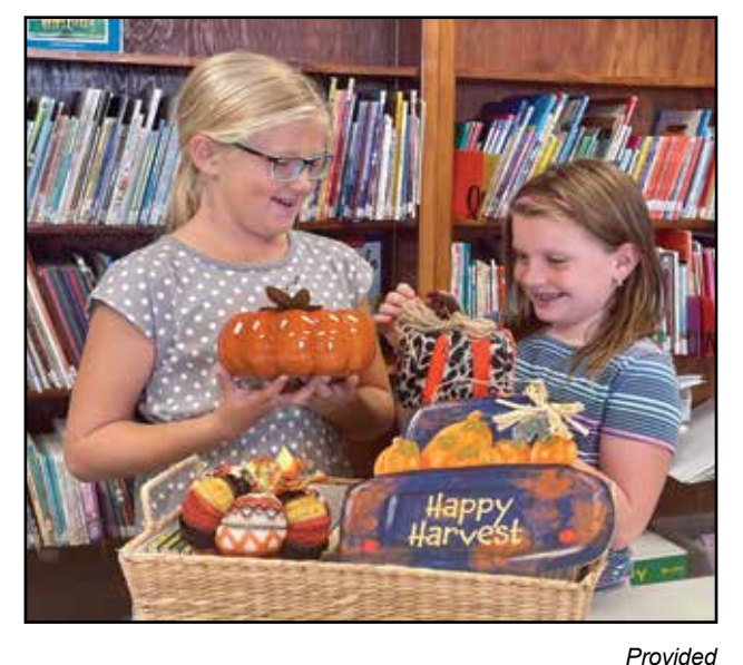
WOCS students prepare a Harvest Basket for the WOCS Hamburger Fry Auction

WOCS is a non-denominational Christian school founded in 1987. Initially holding classes in Bessie, two years later it moved to the current location in Clinton. The Weatherford campus was added in 2007 and the Elk City Campus in 2011. WOCS provides Bible-based academic instruction for students, beginning with pre-kindergarten and continuing through sixth grade. The school offers computer, art, music, physical education, and Bible classes in addition to the standard curriculum. WOCS is accredited through the Association of Christian Schools International (ACSI) and the State of Oklahoma.