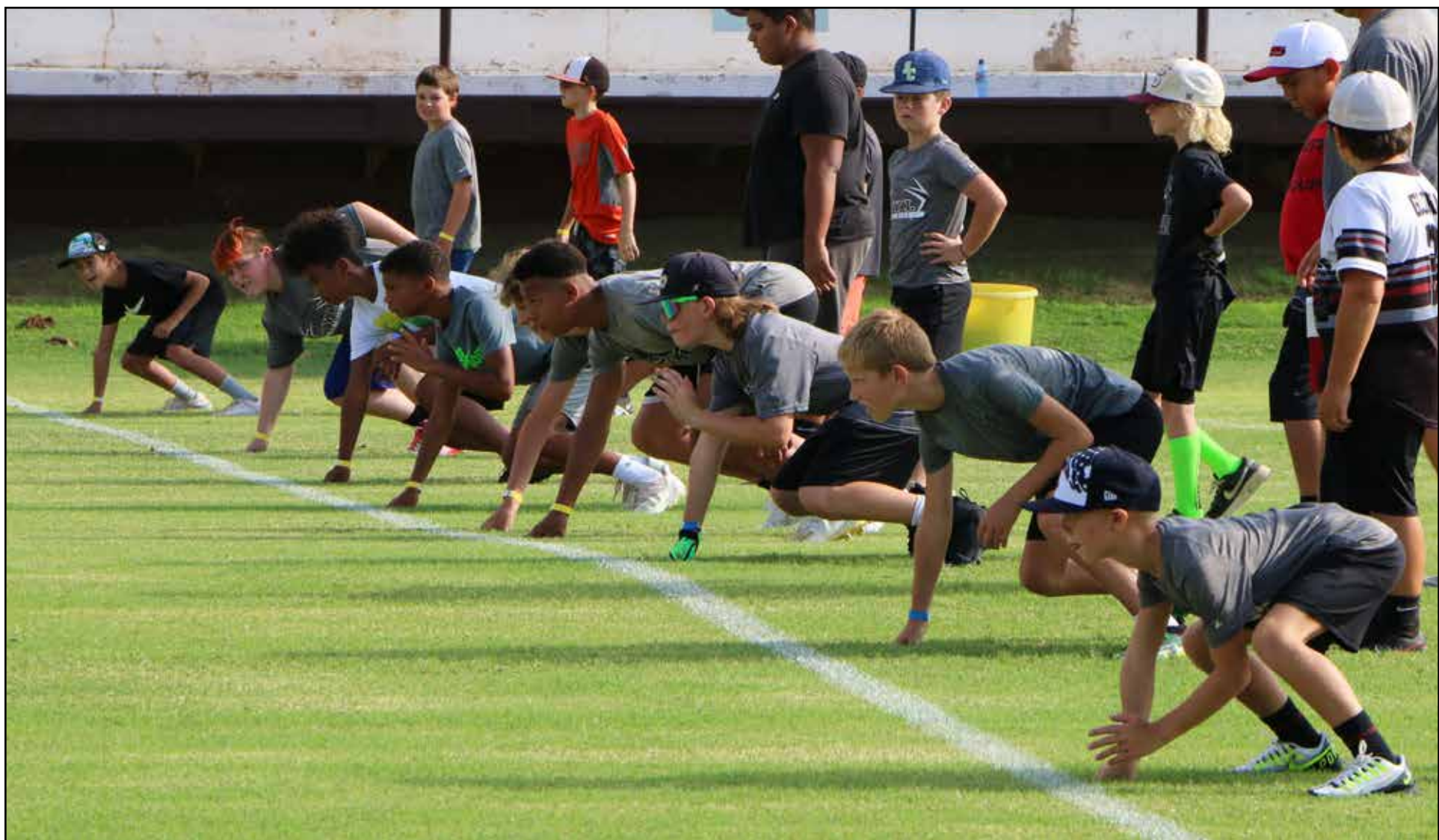
Natalie Simpson / WW

July 27-Aug. 2, 2022 • 10040 Hwy 54 • Weatherford • (580) 772-5939 • email: sales@westokweekly.com • www.westokweekly.com • Vol. 9 No. 29