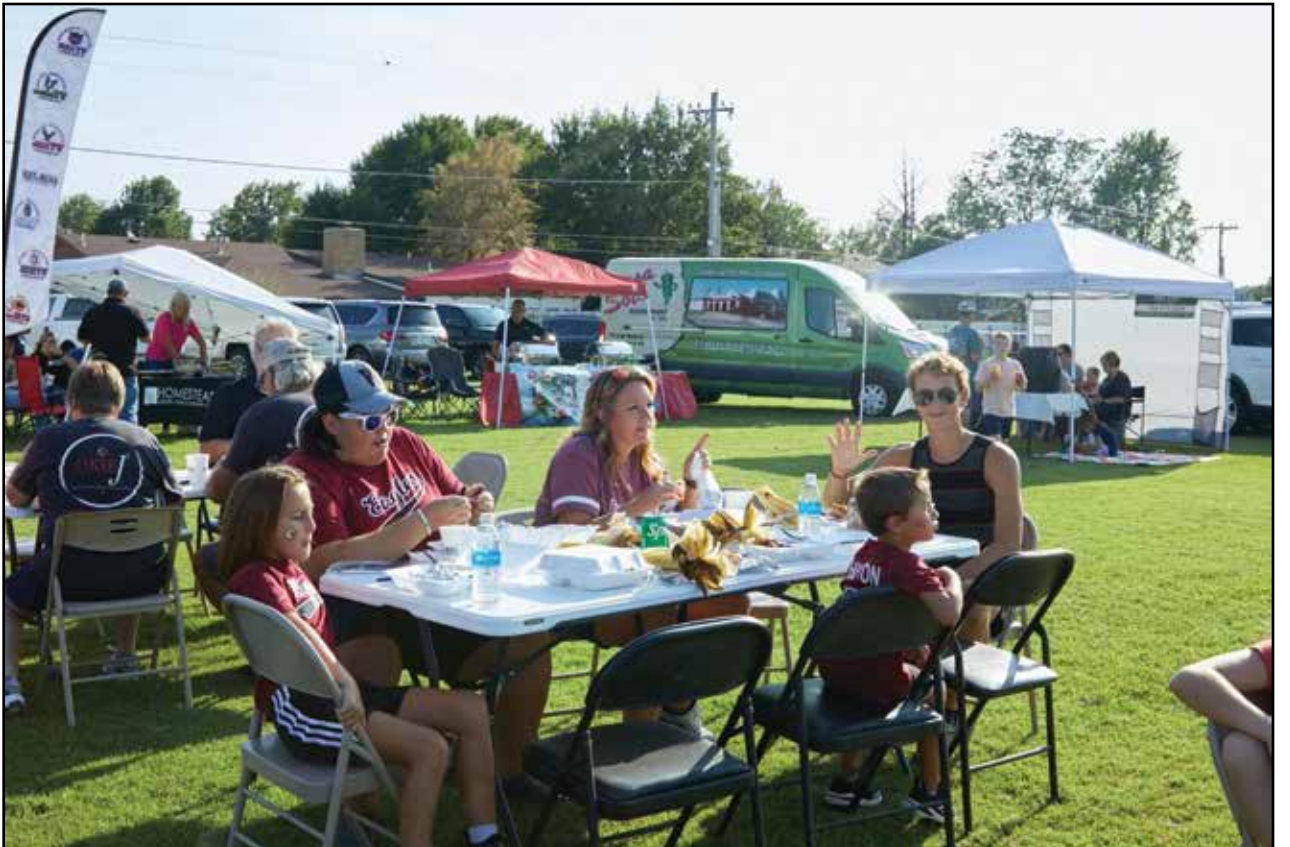
The Weatherford Quarterback Club recently held the annual tailgate party. Local businesses and organizations served the community different prior to the football game.

This is good for Oklahoma because we plan to hire as many Oklahomans as possible (within the requirements of the LevittAMP grant) and will publicize it across the state. This is good for Clinton, Weatherford, Elk City, and other communities as they are seeking ways to revitalize and engage tourism within this part of our state. Additionally, part of the grant will allow SPI and the professional artists to work with students in the local school districts. And lastly, it is good for Oklahoma artists to have exposure within the state and to the Levitt Foundation. The Oklahoma Arts Council will be aiding us in marketing as well. To vote online, or text to vote online for this project go to Levitt.org/vote . The Text to Vote Keyword is CLINTAMP.