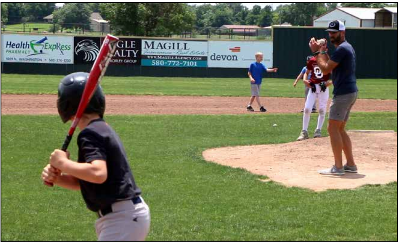
Courtney Graybill / WW

Campers work to stretch their arms for the rigorous amounts of pitching they would be doing for the next few hours.