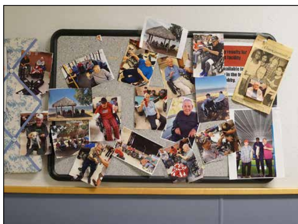
Chad Gray / WW