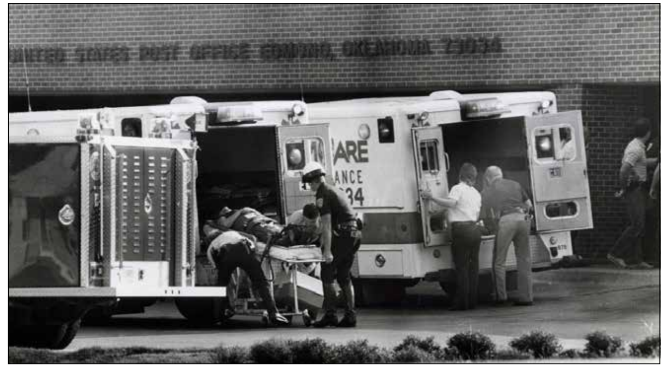
Paramedics rush wounded victims of the Edmond Post Office Massacre, August 20, 1986.