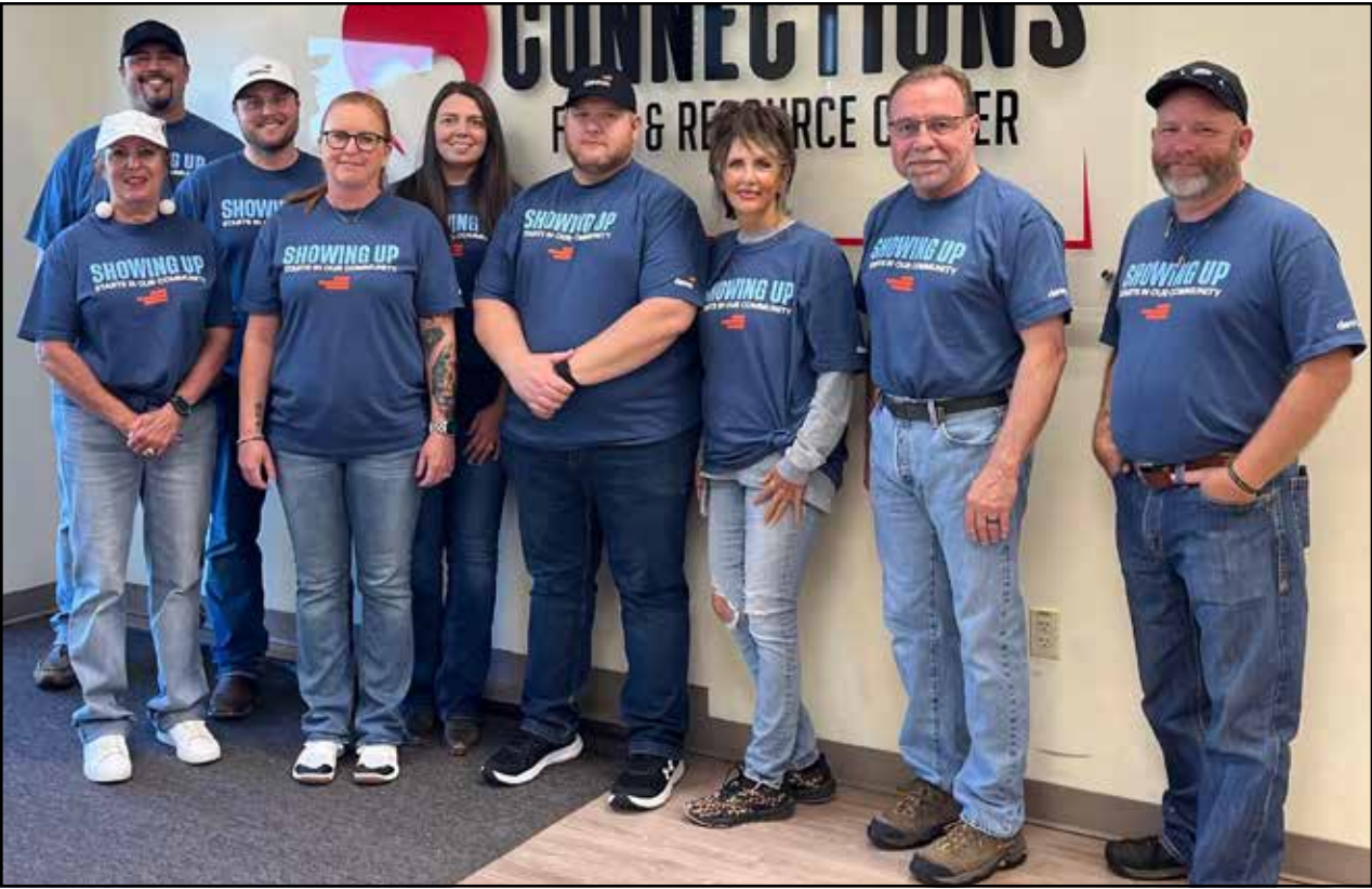
On September 23rd, the “Give for Gold Golf” Tournament, a sold-out fundraising event, will be held in Weatherford to benefit Connections Food & Resource Center. This initiative was made possible by the dedication of Devon Energy's hardworking team, filled with purpose and community spirit.