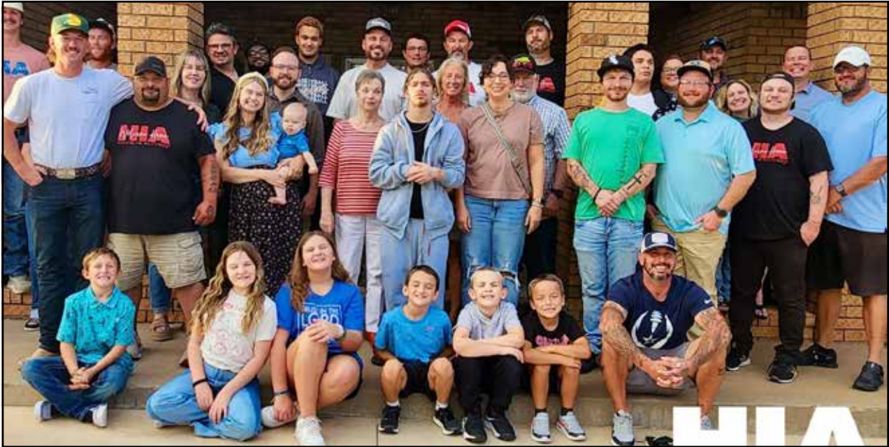
Hope is Alive's annual "Run For Hope" returned to Weatherford on Saturday, September 6. Pictured are residents, alumni, leaders, supporters, friends, and family showing up in support of loved ones fighting to stay sober.