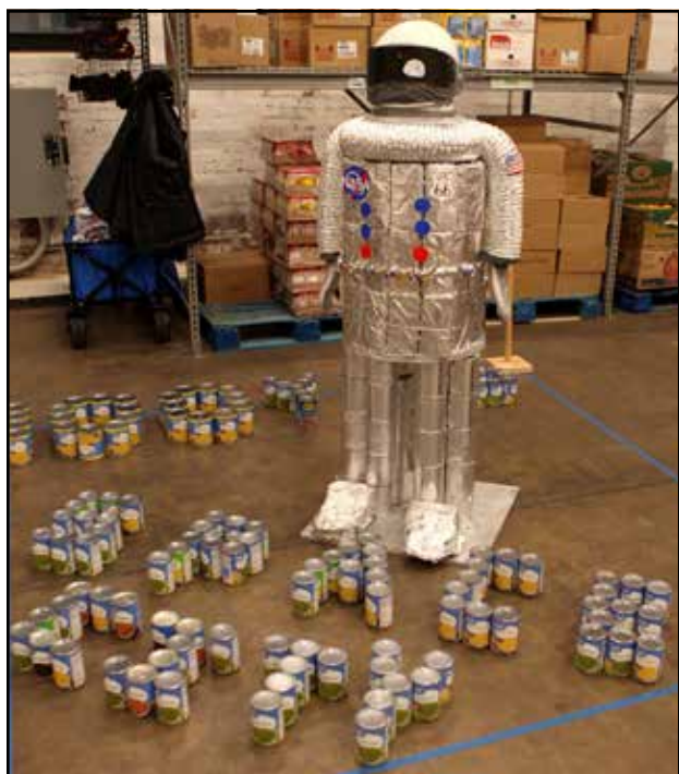
Connection Food & Resource Center / Facebook

The Hydro Methodist Church's "Lucille's Gas Station" brought in the most pounds of food, featuring custom labels on the gas pumps' dial readouts.