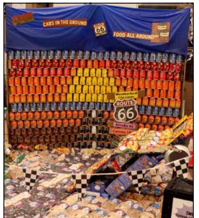
Connection Food & Resource Center / Facebook

SWOSU's Sigma Phi Lambda won "Best Use of Labels" for their Tow Mater.