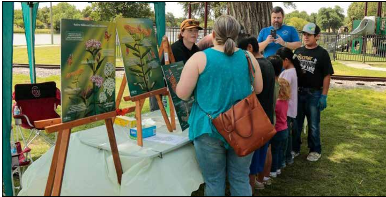
Participants engaging with vendors at an "Okies for Monarchs" regional event in Woodward.