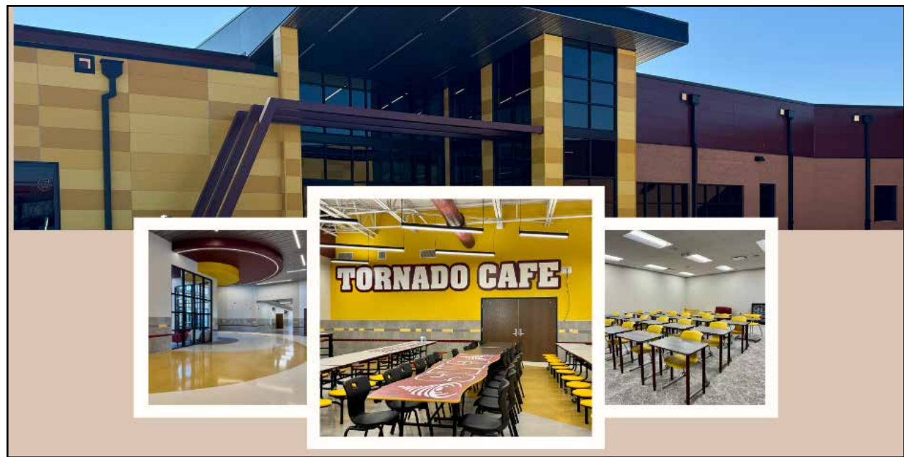
Photos of Clinton's new Middle School, which hosted its first class February 3, 2026.